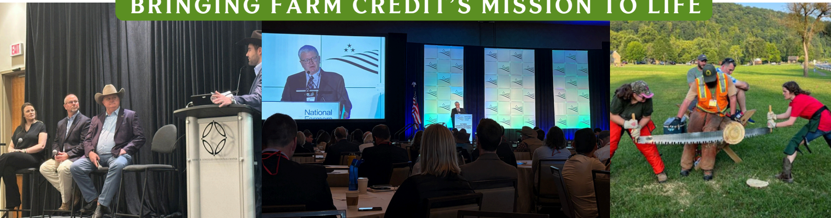
National Cattlemen's Beef Association CattleCon